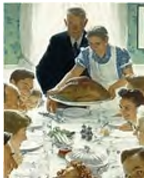
"Freedom from Want" 1943 Painting by Norman Rockwell

One of my favorite paintings of Rockwell's is titled "Freedom from Want." It depicts a family gathered around a Thanksgiving table, and an aproned woman, her husband at her side, preparing to set a large platter, covered with an even larger turkey, on the table.